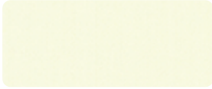
Ivory 102 in